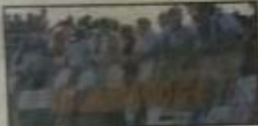
SECURITY SWITCH: A new firm of bouncers has been hired to provide security at this summer's festival

A 36-year-old man from Southend was also arrested in connection